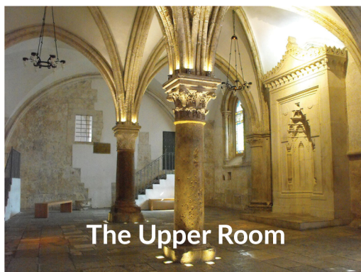
The Upper Room