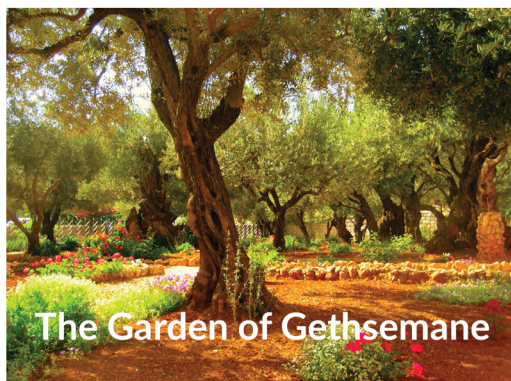
The Garden of Gethsemane