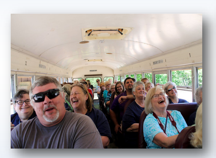
THE BUS RIDE