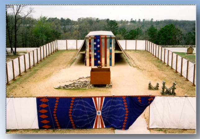
THE MOSES TABERNACLE