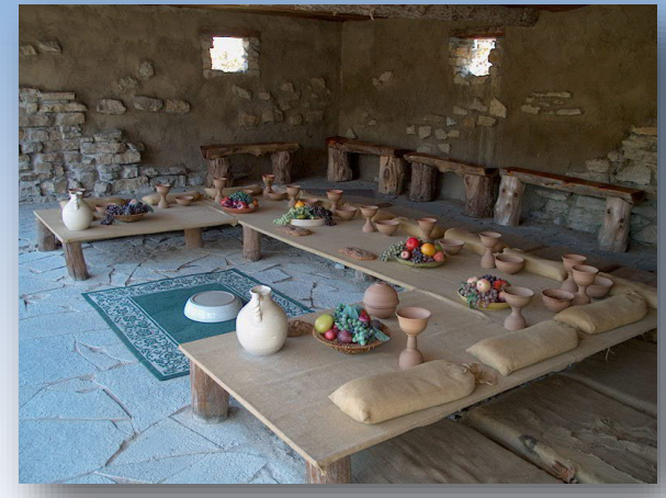
THE UPPER ROOM