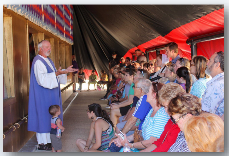
INTERACTIVE BIBLICAL TEACHING

Everyone in your group will enjoy the educational and inspirational experience of the Holy Land Tour on our comfortable bus. As you tour through the Holy Land, your Guide will explain each exhibit and will stop along the way to allow you to meet Biblical characters who will help you understand the living history of the scriptures. Each of the individual exhibits in the Holy Land Tour have been researched for historical accuracy and have been recreated as authentically as possible.