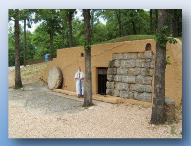
THE GARDEN TOMB

Everyone in your group will enjoy the educational and inspirational experience of the Holy Land Tour on our comfortable bus. As you tour through the Holy Land, your Guide will explain each exhibit and will stop along the way to allow you to meet Biblical characters who will help you understand the living history of the scriptures. Each of the individual exhibits in the Holy Land Tour have been researched for historical accuracy and have been recreated as authentically as possible.