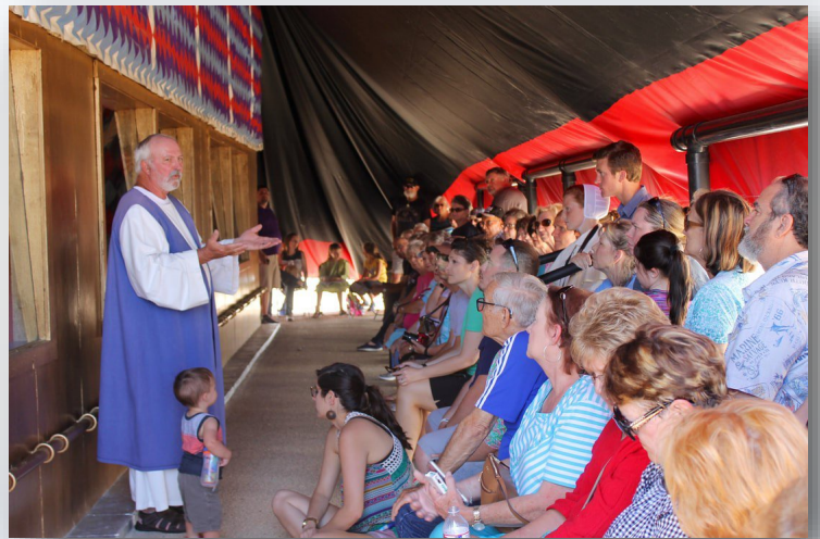
INTERACTIVE BIBLICAL TEACHING

Everyone in your group will enjoy the educational and inspirational experience of the Holy Land Tour on our comfortable bus. As you tour through the Holy Land, your Guide will explain each exhibit and will stop along the way to allow you to meet Biblical characters who will help you understand the living history of the scriptures. Each of the individual exhibits in the Holy Land Tour have been researched for historical accuracy and have been recreated as authentically as possible.