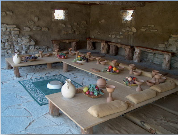
THE UPPER ROOM