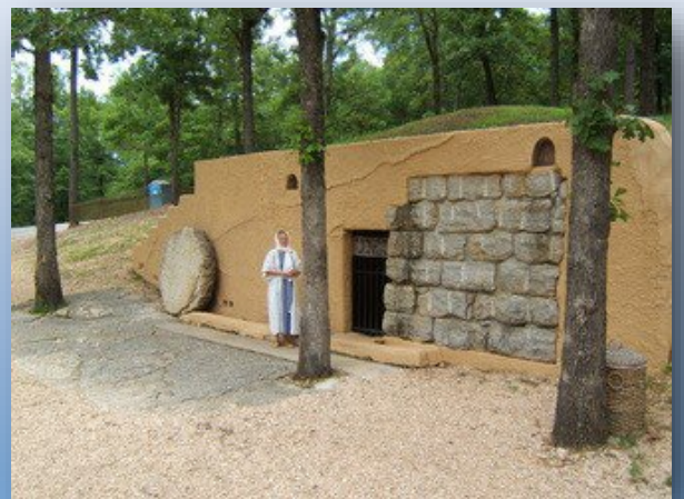
THE GARDEN TOMB

Everyone in your group will enjoy the educational and inspirational experience of the Holy Land Tour on our comfortable bus. As you tour through the Holy Land, your Guide will explain each exhibit and will stop along the way to allow you to meet Biblical characters who will help you understand the living history of the scriptures. Each of the individual exhibits in the Holy Land Tour have been researched for historical accuracy and have been recreated as authentically as possible.