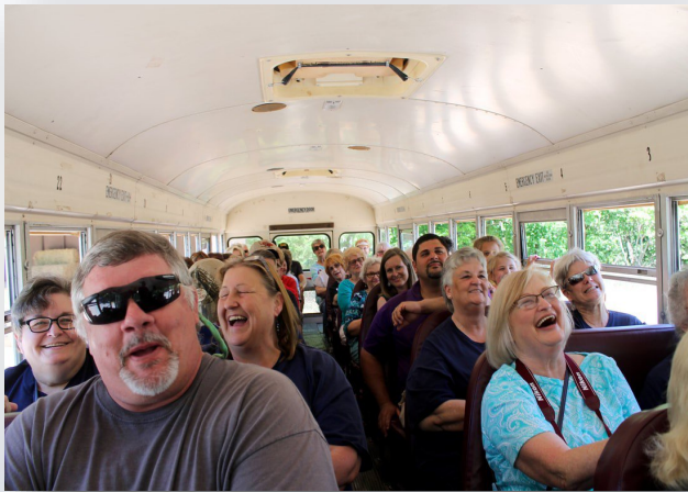
THE BUS RIDE